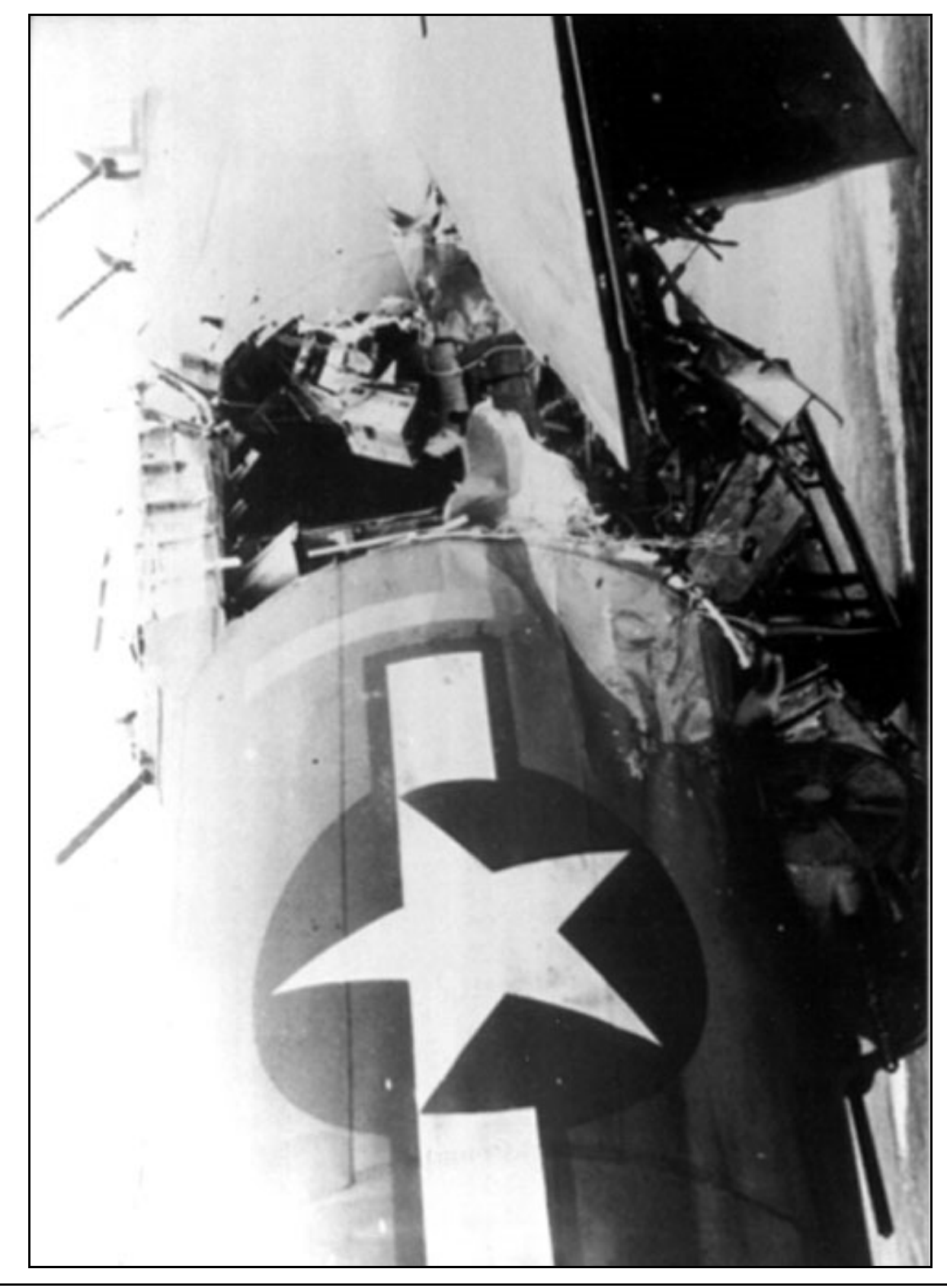
The shattered fuselage of "Miss Irish."