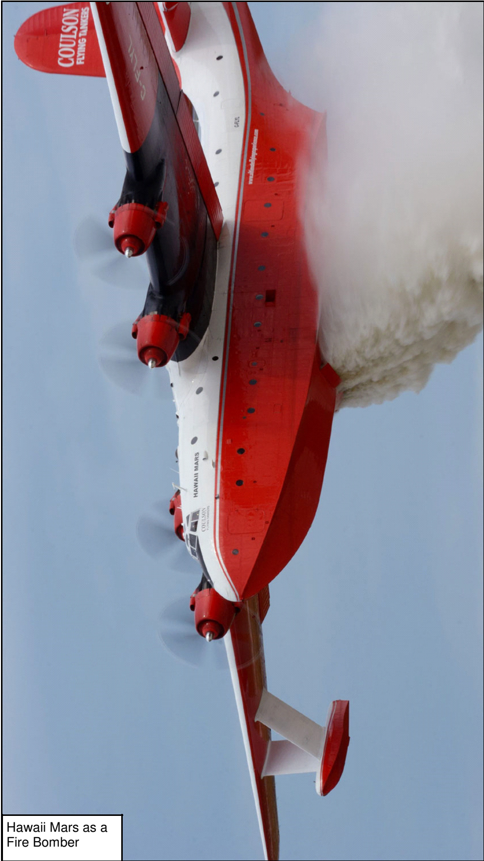
Hawaii Mars as a Fire Bomber