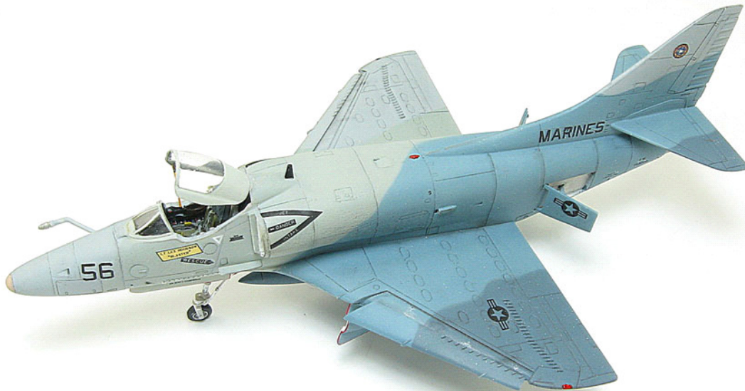
Fujimi 1/72 A-4E Skyhawk by Frank Cuden