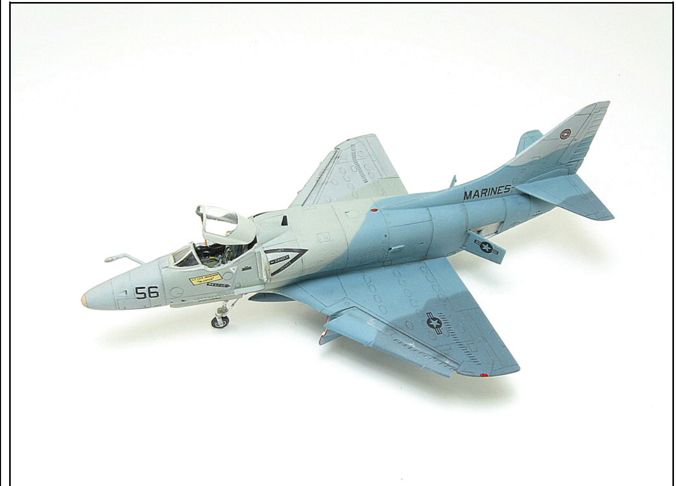
Fujimi 1/72 A-4E Skyhawk by Frank Cuden