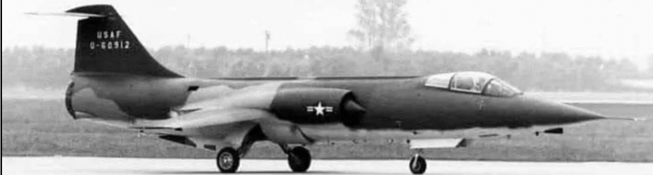
How some modelers see it...