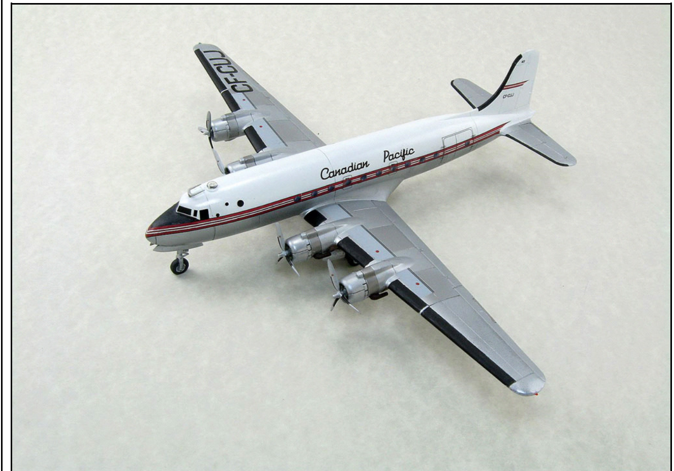
Minicraft DC-4 by Frank Cuden