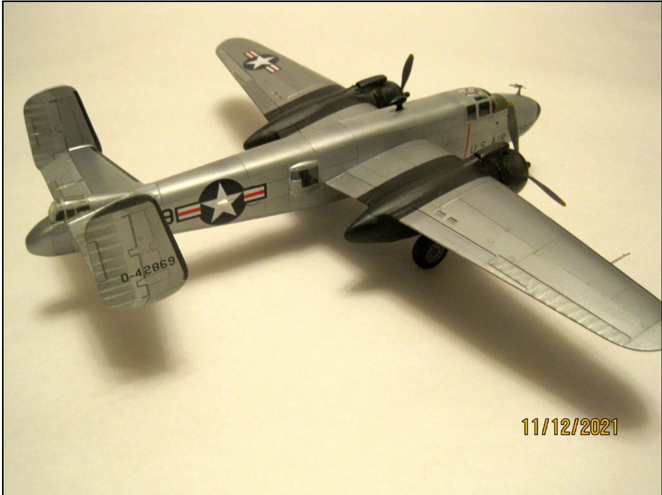
1/48 Scale Monogram B-25J modified to TB-25K by Dennis Strand