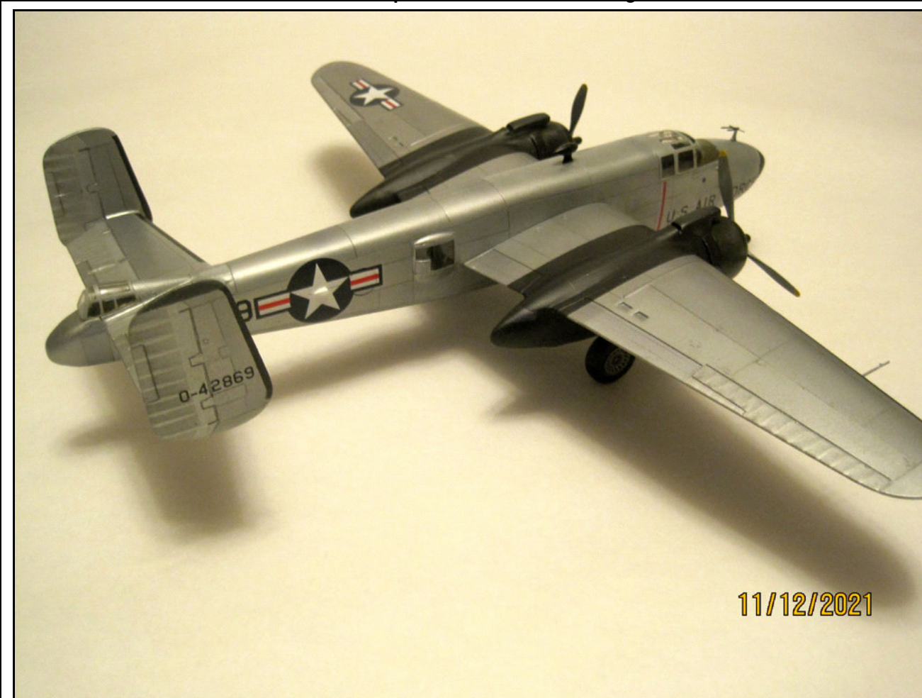
1/48 Scale Monogram B-25J modified to TB-25K by Dennis Strand