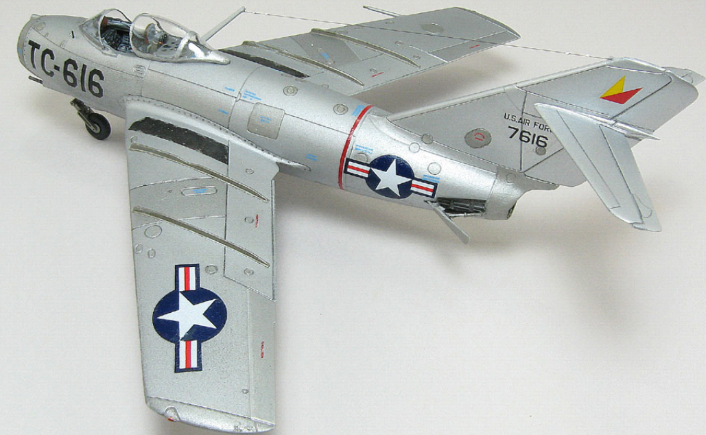
Hobby Boss 1/72 scale Mig-15 Faggot by Frank Cuden