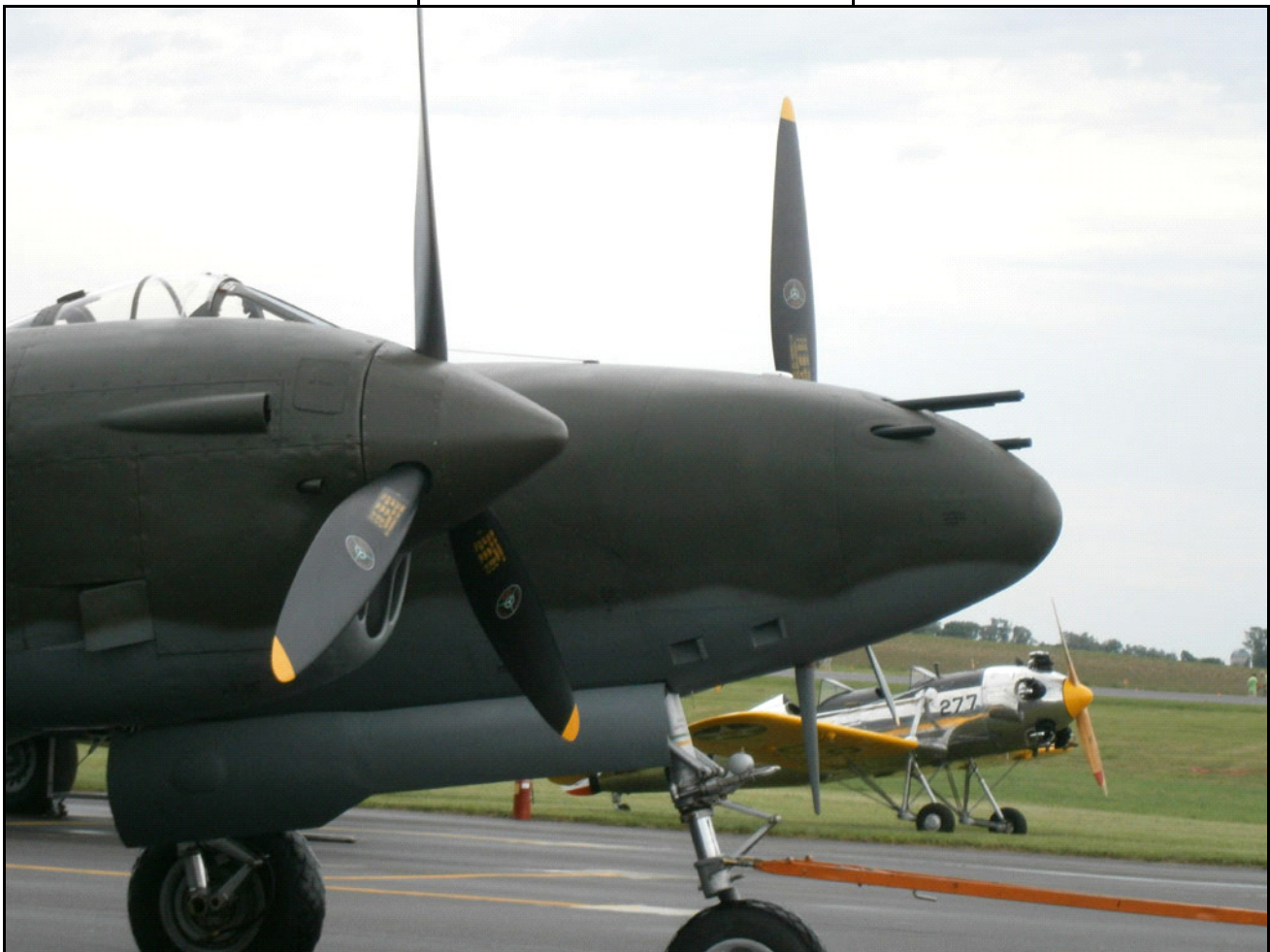
The Business End of the P-38 Lightning Fagen Fighters 2018 Airshow