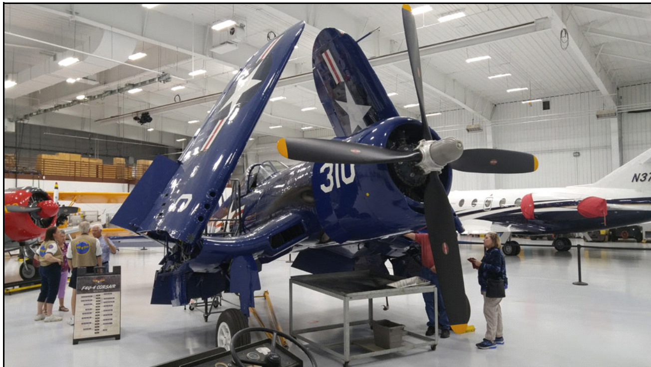
F4U-4 Corsair 1:1 scale Wings of the North Museum