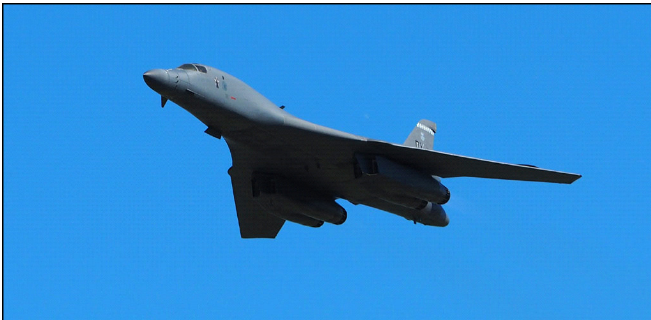
B1-B Photos from Oshkosh 2017