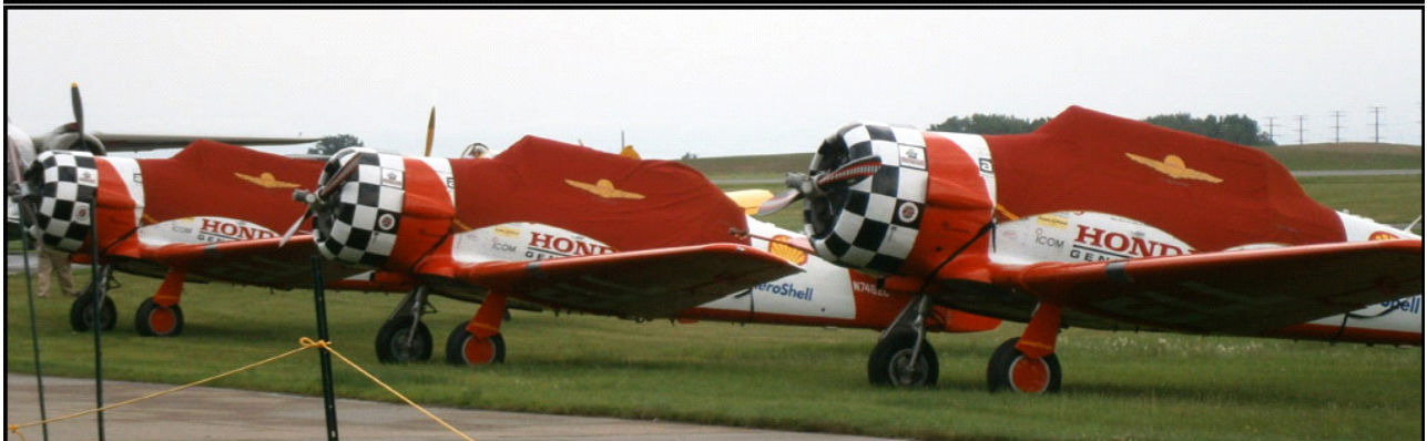
Fagen Fighters 2018 Airshow SBD Dauntless; FM-2 Wildcat; AeroShell AT-6 Aerobatic Team