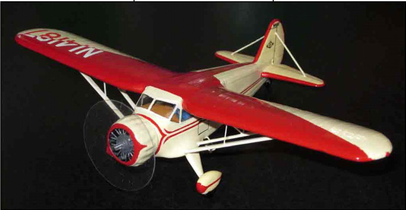
Scratch-Built Stinson SR-5E by Noel Allard