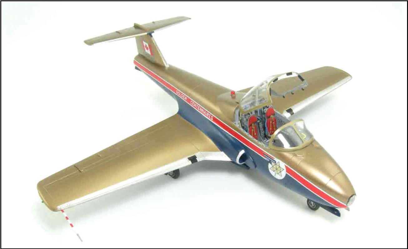
Belcher Bits 1/48th scale all-resin CT-114 Tutor by Frank Cuden