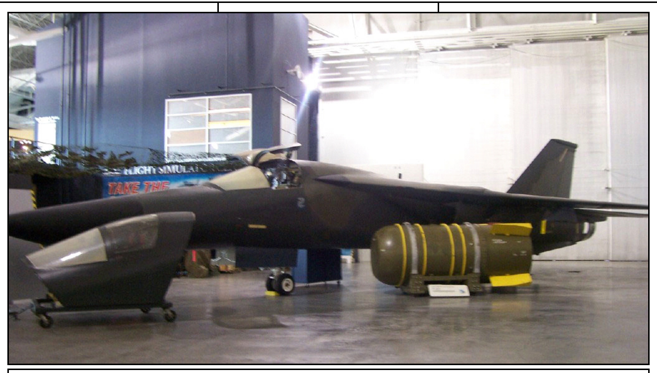
FB-111A Aardvark Initial deployment: Nov 1970, 340<sup>th</sup> Bomb Group, Carswell AFB, TX. Final Deployment: Mar 1988, 380<sup>th</sup> Bomb Wing, Plattsburgh AFB, NY. One of the last four to leave the base ending the career of this type with SAC.