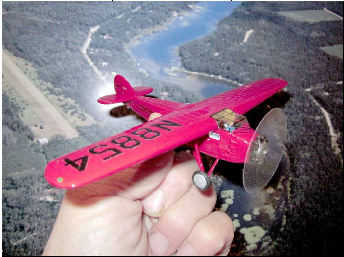
Scratchbuilt 1/72 1929 Cessna DC-6B by Noel Allard