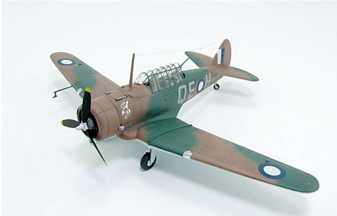
1/72 Special Hobby Commonwealth Wirraway by Frank Cuden