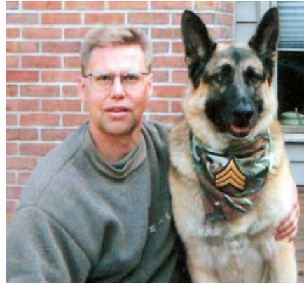
Photo taken of me & "Sergeant" 3 years ago – I'm the one on the left in case you're confused.

"I'm not dancing, I'm waltzing." ~ Quote from the movie "Sweet Land" (2006)